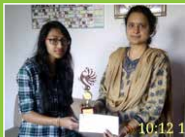
TIS received a trophy and an appreciation certificate for their initiative to SAVE BIRDS during Uttrayan by Trust PaPa