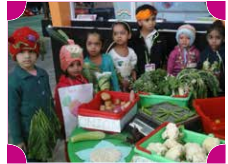
CELEBRATING VEGETABLE DAY: Truly vegetarian