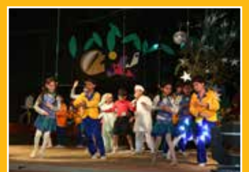
SWARAG SE SUNDAR: TDS ( Std I and II) : Exploring theatrical skills among the young learners by doing and experiencing.