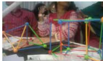
Maths & Science workshop at Fortune Plaza