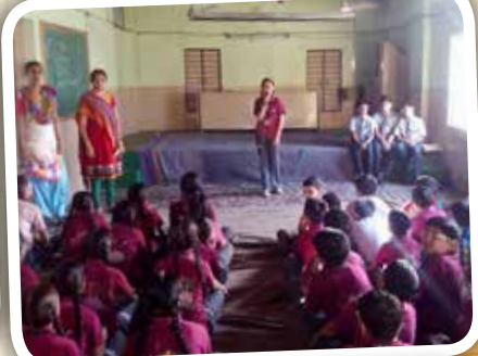
Elocution Competition: Strengthening Language skills and Confidence