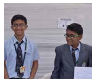
Swachh Bharat Abhiyaan: National Youth Day