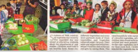
Students participating in a 'Vegetable Day' by preparing and eating vegetables.