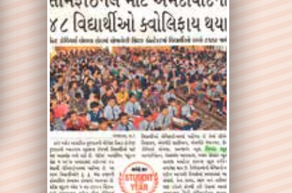
A group of students participating in a seminar or conference.