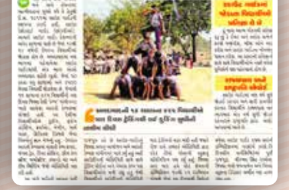
A group of scouts and guides performing physical exercises.