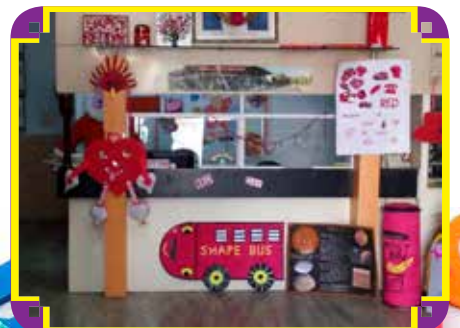
RED DAY CELEBRATION