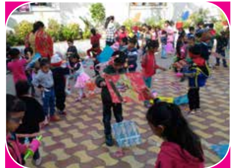
CELEBRATING UTTARAYAN: Attempting to fly a kite