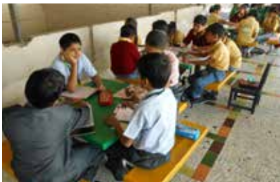
IMO Maths Olympiad SOF: Enhancing reasoning and problem solving skills