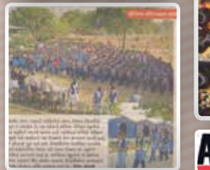
A scenic view of a landscape, possibly a park or a natural area.