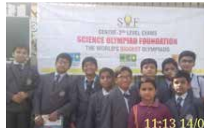
Students all set for SOF 2nd Level Exam