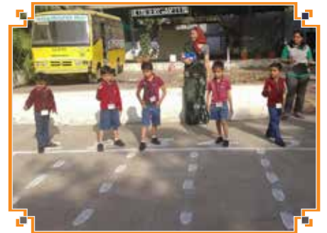
SPORTS DAY: In true sportsman spirit