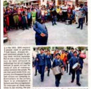
Students performing a play on stage to raise awareness for a social cause.