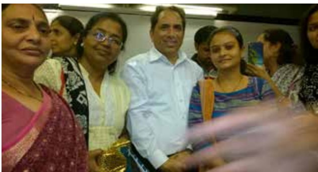
Celebration of Hindi Diwas