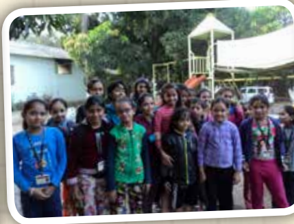
Picnic: A Healthy Recreation to Rasala Nature Park