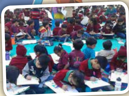
Drawing Competitions: Imprints of imagination and experimenting