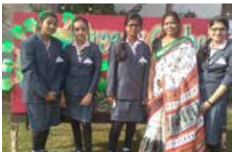
Green School Workshop at DPS