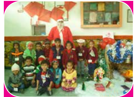
CELEBRATING CHRISTMAS: Hey! Santa is here