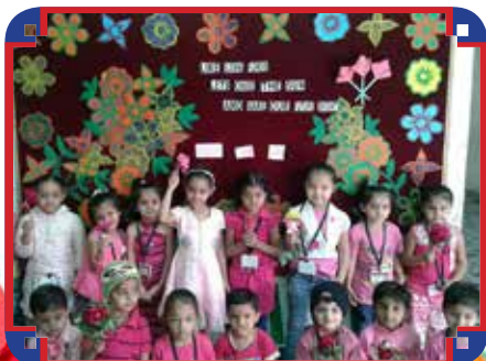
PINK DAY CELEBRATION