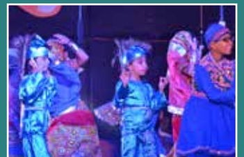
TALAASH EK MEETHI ZUBAAN KI: TIS ( Std I and II): An event that marked development of comprehensive skills, improving understanding in learners vital to a well rounded education.