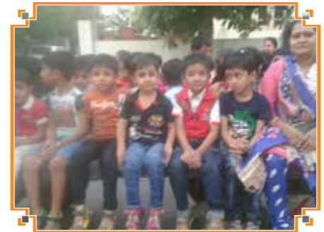
NIGHT STAY AT MY SCHOOL: A home away from home