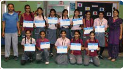
Overcoming Obstacles: Winners of Kabbadi, TIS, Gujarat Vidyapith