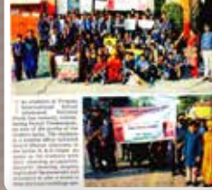
A group of students participating in a 'Clean Green India' awareness program.