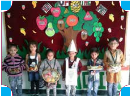
CELEBRATING FRUIT DAY