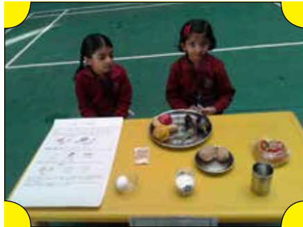
SCIENCE ACTIVITIES: See the tiny hands weave the magic