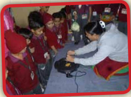
Pop...pop... making popcorns