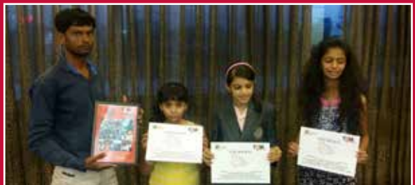
The students of Tripada with the certificate of appreciation for their heart rendering composition on their mothers, "Make Your Mother Smile"