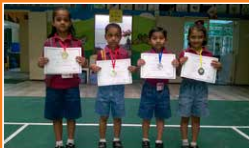
Playing Like a Champion : Winners of K.G. Athletic Meet, Gems Genesis International School