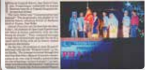
A group of students performing on stage during an annual function.