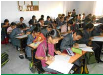
Bharatiya Sanskrit Gyan Pariksha – Gayatri Teerth Haridwar