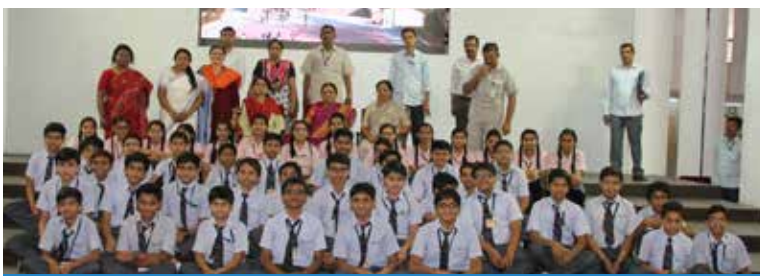
Visit to Vidhan Sabha: Smt. Anandiben Patel, CM of Gujarat with Tripadites