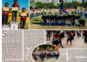
Students participating in various sports activities during an annual sports meet.