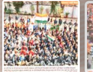
A group of students performing on stage during a cultural event.