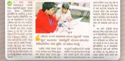
A person using a device to generate power from walking.