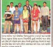
A group of students receiving medals for their performance.