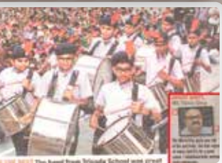
A group of students performing a musical piece.