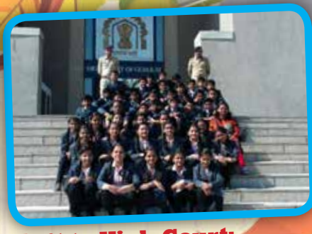
Visit to High Court: Extending lesson beyond classroom