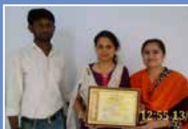
Beam with Pride: TIS received the Governor's certificate of appreciation for maximum participation and 100% results in Sanskriti Gaurav Exams.