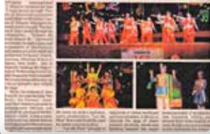
Students performing on stage during a theatrical performance.