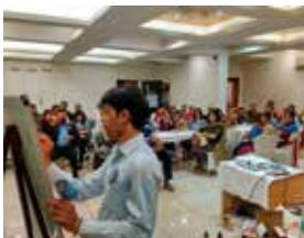
CAMEL KOKUYO ART: Art teachers workshop at hotel Rock Regency