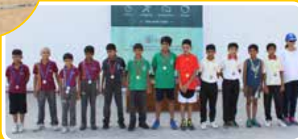
In a Winning Spree: Champions of Various Athletic Events held at Gems Genesis International School, Ahmedabad