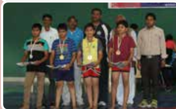
Achieving Milestones: Winners of various events at Khel Mahakumbh, Tripada Day School