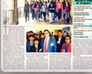
A group of Tripada students visiting Fresno, California.