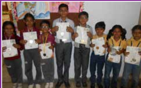
In Cloud Nine: Winners ( TIS ) of International Talent Search Essay Competition, Avantika Cultural Olympiad