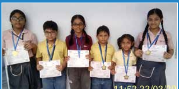
Pride and Joy: Winners of Hindi Essay Writing Competition (TIS), RashtraBhasha Vikas Parishad, Pune